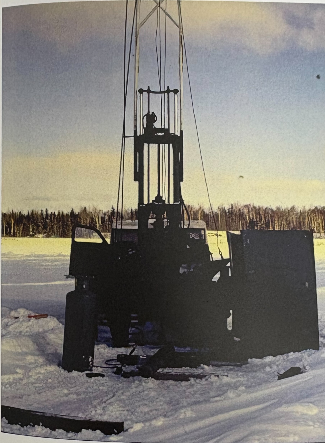
Figure 33: Auger & Split Spoon Drill Evaluating Tailings Tonnage and Au Grade

The photograph in Figure 33 is that of the Marathon auger rig used to delineate the remaining tailings in the former Kirkland Lakebed so that a Resource estimate could be compiled.