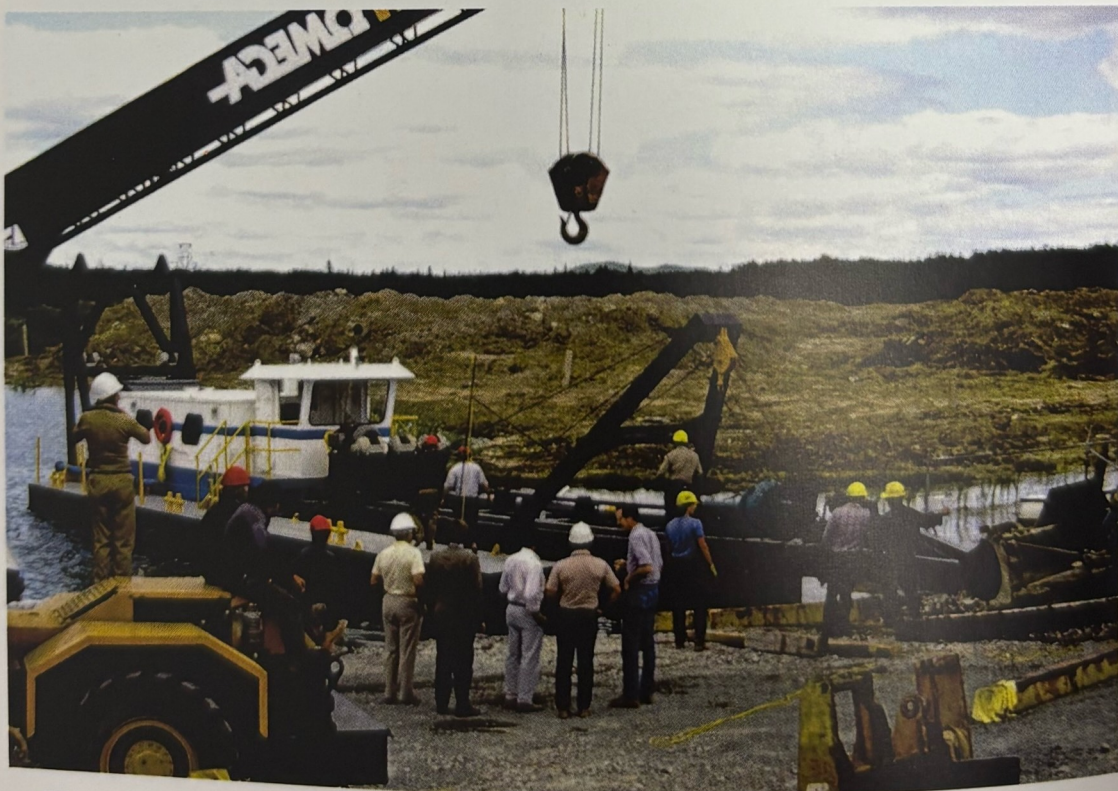
Figure 36: Launching of the Lady LAC Tailings Dredge

The tailings in behind the mall were recovered with the Lady LAC dredge and piped to the Macassa mill for treatment.